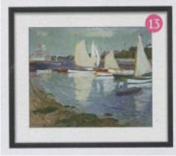
13 Look like you spent hours antiquing with this (new) framed print. Le Port De L'Orient , 1890 framed print by Henry Moret, $150; art.com.